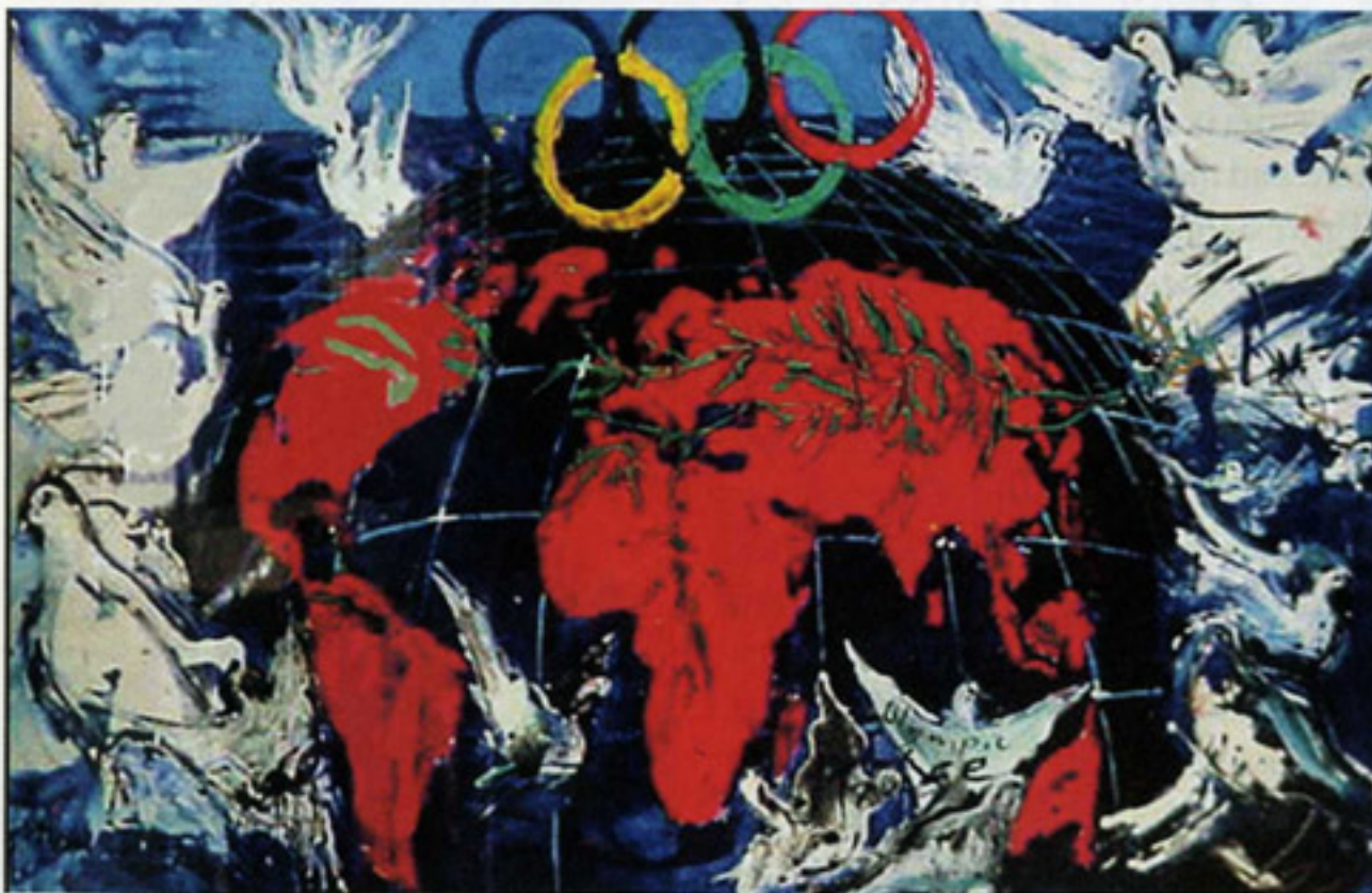
"Olympic Truce" by Mina Valyraki-Papatheodorou, Academy Sport Artist of the Year 2002

Mina Valyraki-Papatheodorou's art reflects the vibrant nature of competition with her use of vivid colors and hues. It is impossible to view one of her paintings and not be taken in by its power and intrigue. This use of color and the theme of the "Olympic Truce" have produced the exact effect sought by the use of Olympic competition to bring about a time, however temporary, of world peace.