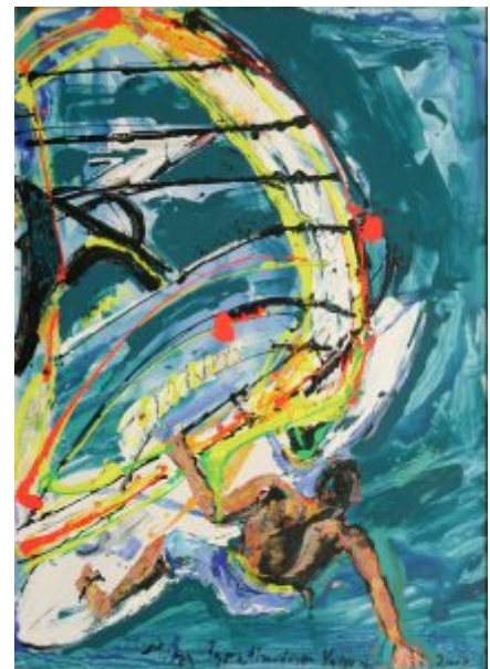
Windsurfing Gone with the Wind by Mina Valyraki

“Our works share the characteristics of movement through light and freedom,” Valyraki said. “There is an exceptional instinct that makes the colors appear pulsing and that the color gestures